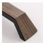
Multi finishing (with film)